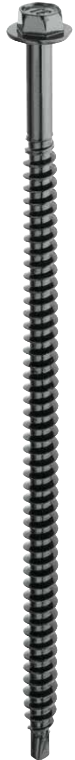
Enlarged to show detail.