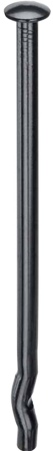
Enlarged to show detail.