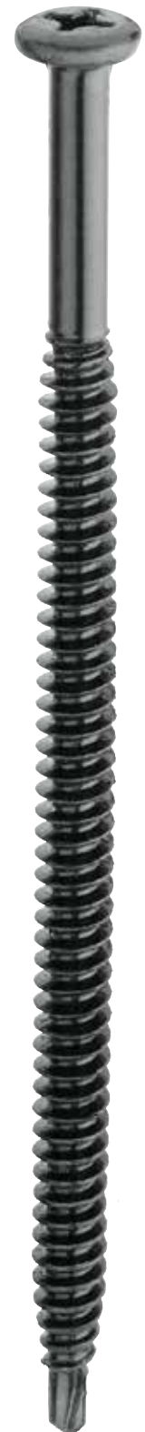
Enlarged to show detail.