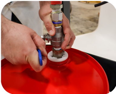
Twist Lock™ Hose Connection (inserted in drum bung)