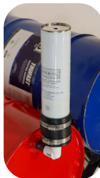
Desiccant (maintains adhesive quality)