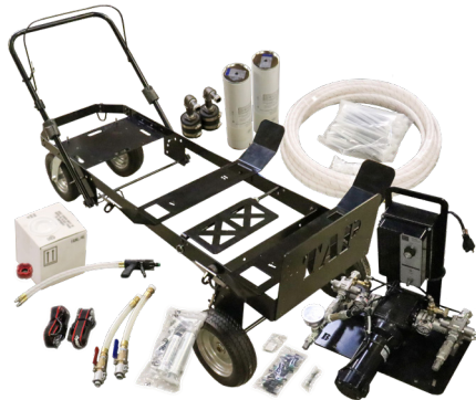
TRUFAST-TAP Pump System Complete Kit - TAP0001K