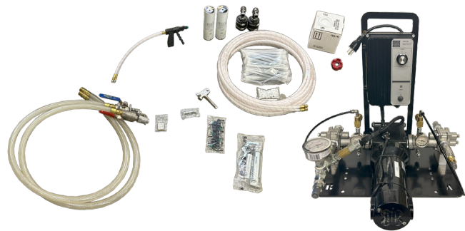
TRUFAST-TAP Pump System Complete Pump Assembly Total Kit - TAP0012K