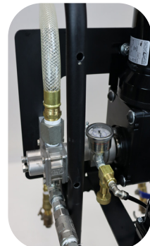
Lubricated Seals & Convenient Hose Connection