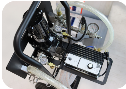
Modular Pump Design (simple maintenance/troubleshooting)